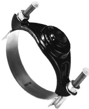
Style 101N-H Nylon Saddle with Stainless Steel Single Strap