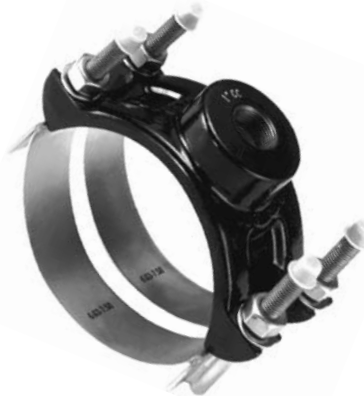
Style 202N-H Nylon Saddle with Stainless Steel Double Strap

For above-ground HDPE applications, contact Romac's Engineering Department at 1-800-426-9341.