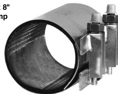
LSS1-5.14 x 8" Repair Clamp

Gaskets: SBR per ASTM D 2000 MAA 610, compounded for water and sewer service. Other compounds available on request.