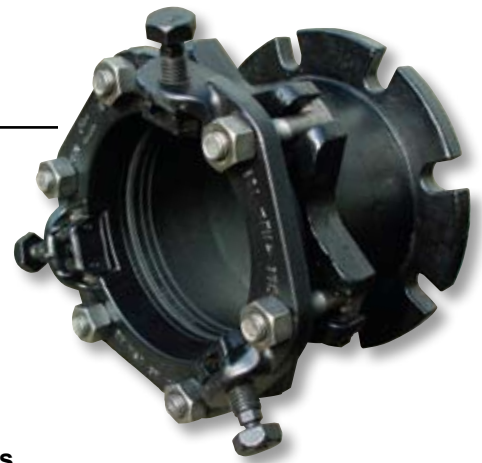
RFCA: For use on DI pipe and IPS size STD steel pipe 3" - 12".