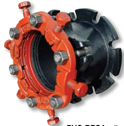
PVC-RFCA: For use on PVC pipe.