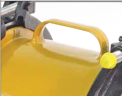
THE HANDLE IS BUILT INTO THE DUCTILE IRON CENTER RING