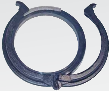
SEGMENTED END-RINGS HAVE INTEGRATED HINGES.