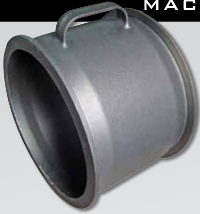
RAW CENTER RING CASTING