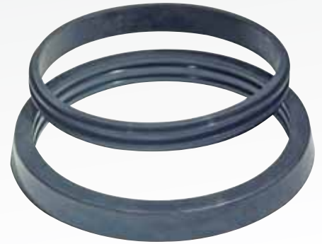
MACRO'S INNER GASKET CAN BE REMOVED AND REINSTALLED

The Macro's™ nesting dual gasket system accommodates a wide range of pipe diameters. Both gasket rings are used to couple smaller pipe sizes. The inner gasket can be removed to accommodate larger pipe diameters. If the inner gasket is removed it can be simply reinstalled if necessary. Gaskets are compounded for water and sewer service in accordance with ASTM D2000. NSF 61 certified gaskets and other compounds available on request.