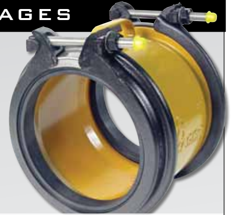
FULLY ASSEMBLED MACRO™ WITH EPOXY COATED CENTER-RING AND E-COATED EPOXY END-RINGS.

Ductile iron parts have different thicknesses along the cross-section, allowing the parts to concentrate strength where it needs to be.