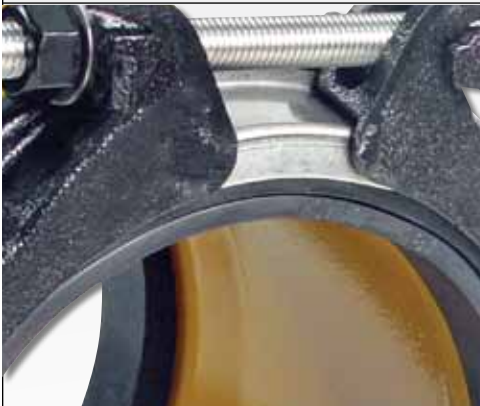
DUAL GASKET SYSTEM NESTS ONE GASKET INSIDE THE OTHER.